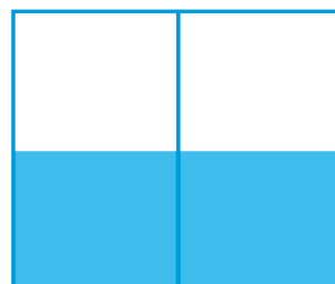
1/2 page spread